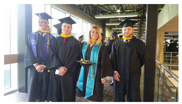
Above & Right: Proud HTMS Students at the May 15th Commencement Ceremony!