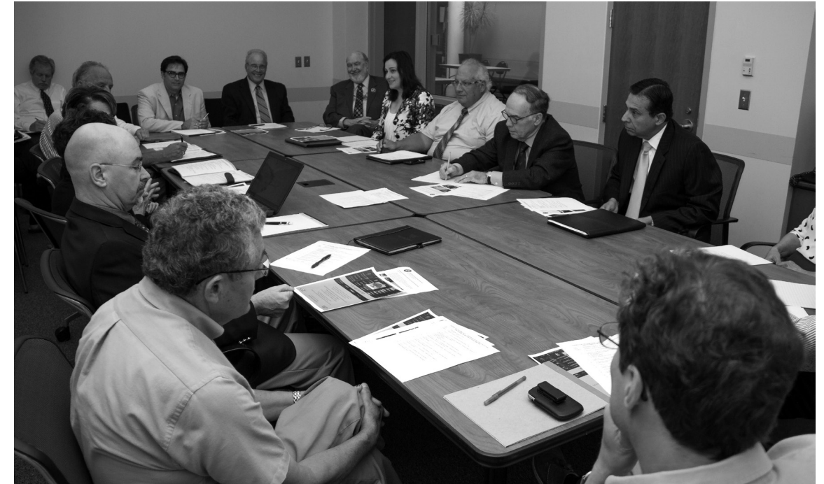
Advisory Board Chairman, Constantelos Hellenic Collection and Reading Room