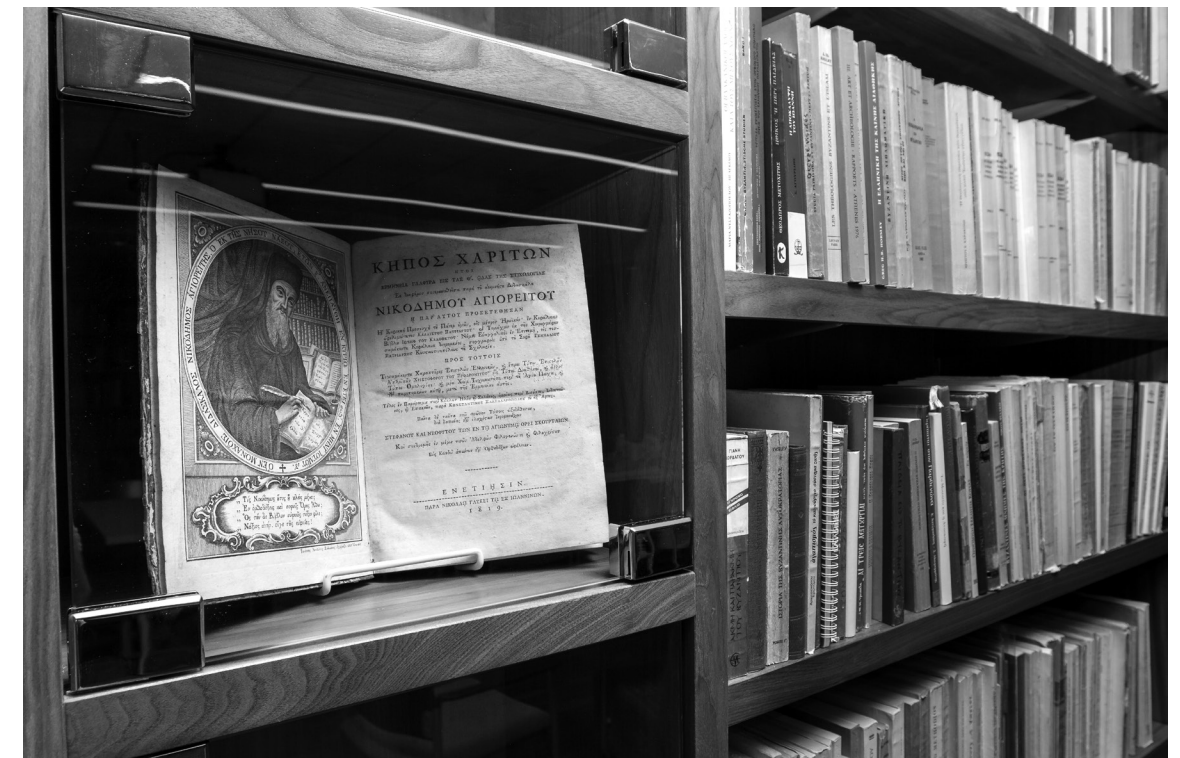
One of the many valuable books featured in the collection.