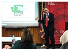
Hughes Center Activities Achievements and awards by Hughes Center members.