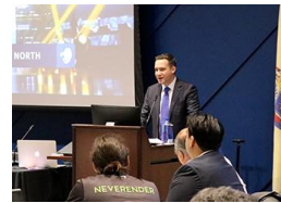
Esports Summit The Center supported the event that discussed how eSports could benefit Atlantic City.