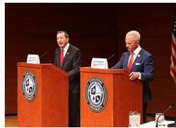
2018 NJ Congressional District 2 Debate The Hughes Center hosted the event on Oct. 10.