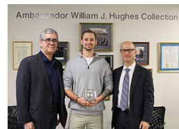
Washington Internship Program Scholarship Meet the latest recipient of the Center's scholarship.