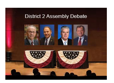
<u>District 2 Assembly Debate</u> Hughes Center to cosponsor the debate