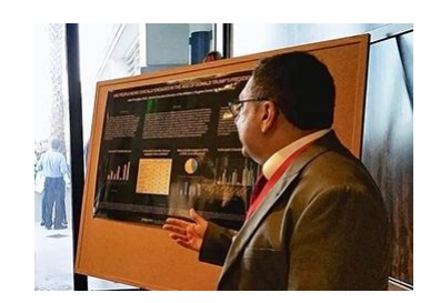
Citizen Engagement and Public Policy Hughes Center Promotes Civic Engagement