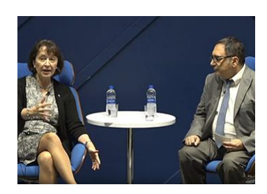
2nd State of N.J. Beaches DEP Commissioner Calls for N.J. Strategic Climate Plan

Thursday, Nov. 14, 2019 Reception 5:30 P.M. Seaview, a Dolce Hotel