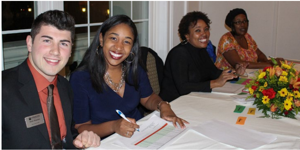
Members of the Council of Black Faculty and Staff Committee