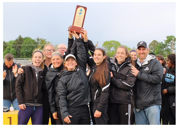
The women's track & field team won their first NJAC title on May 7.