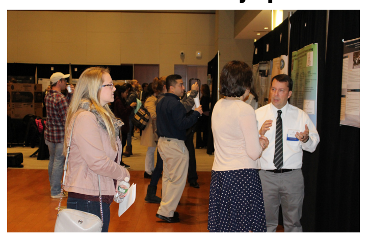
Students share their projects and results during Stockton's Graduate Research Symposium on Dec. 4 in the Campus Center. <u>View more photos</u>.