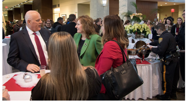
The University community celebrated Stockton's Annual Holiday Party on Dec. 15 in the Campus Center. View more photos.

The Stockton Times will take a break next week and return in January 2018.