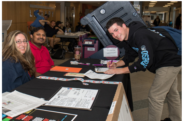
A Stockton student registers to vote on National Voter Registration Day in 2016.