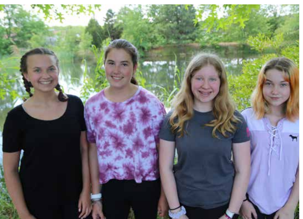
Seventh-graders at Galloway Township Middle School enjoy the outdoor classroom.