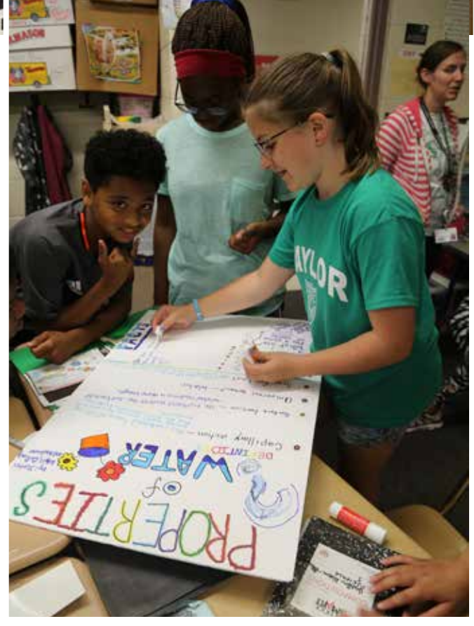
Fifth-graders work on Nature Fest projects.