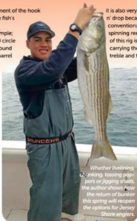
Whether livelining, chunking, tossing poppers or jigging shads, the author shows how the return of bunker this spring will reopen the options for Jersey Shore anglers.

it is also very effective. I prefer this over snag n' drop because I like fishing for bass with a conventional set up, but snag bunker with a spinning reel set up. One other advantage of this rig is that the bunker is not directly carrying the weight of the sinker or weighted treble and therefore, gives the bunker a