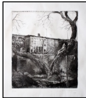
Yunona Kirakosyan "Old Gyumri" Intaglio printmaking Gyumri city before the 1988 earthquake refugee crisis