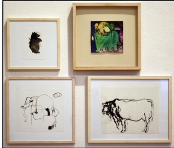
Sylvia Pasztor Top left "Tübbi" Top right "Fanti" Bottom left "Vieh" Bottom right "KUH"