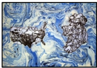
Natasha Strom "Family Maps" Silkscreen and marbled paper