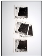
Merujd Ogganesovich "Memory" Collage of 4 Intaglio printmaking plates 1988 Armenian earthquake