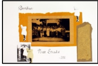
Kelsey Hammock solar plate etching , collage