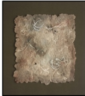
Lusine Agababyan "History of human migration" Canvas, cast paper