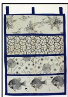
Brandi White Columbus College of Art and Design Silkscreen on fabric